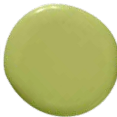
HIGH STRUNG SW 6705 SHERWIN-WILLIAMS

"This is a brilliant green, deeper than chartreuse. It's kind of like sunlight through a leaf. And it comes as a surprise in the library of an apartment in an all-glass skyscraper, where the rest of the rooms are fairly beige. It reminds you of the grass and the greenery outside."