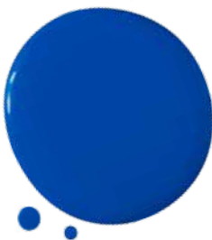
EVENING BLUE 2066-20 BENJAMIN MOORE

"I'll often use this Yves Klein blue to dramatize a room. Paint it on one wall and you are instantly transported to an island in Greece, where you'll see this hue in the water and on window frames against white-washed walls. It makes me feel as if I'm basking in the sun."