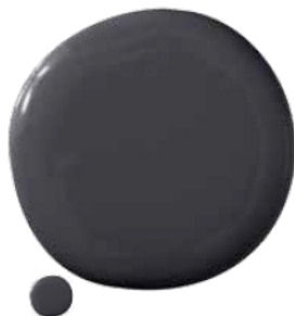
TEMPTATION 1609 BENJAMIN MOORE

"In the Mississippi Delta, the sun can be overpowering at midday, when my client is in her study. So I painted the walls, moldings, and bookcases in this flint gray, a true gray that doesn't go purple or blue. With bleached floors, a white ceiling, and Belgian linen on the furniture, the room feels cool and calm."