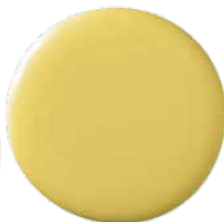
SPICY BANANA PEPPER 50YY 60/538 GLIDDEN

"For a sunroom, I like this acidic yellow with undertones of green and brown, to ground it and keep it from feeling too saccharine. Colors appear lighter in bright rooms, so go a shade deeper than you first think. Layer in sea grass, overstuffed wicker furniture, maybe a pop of coral, and creamy white trim. It will feel happy by day and sophisticated by night."