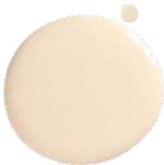
IVORY PALM 6012P FINE PAINTS OF EUROPE

"This classic yellow would make any room cheerful. It absorbs the light and bounces it right back, so when the sun shines, it absolutely glows. Yellow is a tricky color, and this is one of a handful that I use. It works because it looks beautiful—and it makes people look beautiful, too."