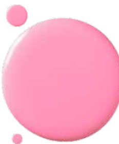
TICKLED PINK 2002-50 BENJAMIN MOORE

"I'm not the type to overthink things. When I found a vintage dhurrie in hot pink for a media room, I knew instantly that the ceiling should play it up. Painting it this really bold pink would ensure that the room is always cheery, even when the sky outside is gray."