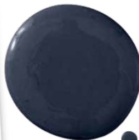
HALE NAVY HC-154 BENJAMIN MOORE

Go with the warmth or temper it with hues that range from bright to soothing.