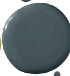
STILL WATER SW 6223 SHERWIN-WILLIAMS

"When the sun hits a wall, it takes the color down a notch or two. But this dark teal blue, with undertones of gray and green, is dark enough that it still looks rich and interesting. I used it on the sunporch of a 1920s Dutch Colonial, where it was a nice complement to terra-cotta floors. The unexpected color draws you into the room."