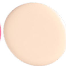
SAN DIEGO CREAM 921 BENJAMIN MOORE

"This rich and versatile cream is my go-to hue, especially when it comes to decorating sun-drenched spaces. A pure white would be too sharp, but this picks up on the softer qualities of daylight. It subtly changes throughout the day and envelops a room in warmth at night."