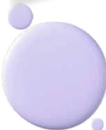
LAVENDER CLOUD 90BB 67/069 GLIDDEN

"The secret to this lavender is that it moves toward gray. It's a suggestion of lavender, rather than dead-on, so it can be very ethereal in the sun and then deeper in the evening. It's a good universal shade—soft and soothing in a bedroom or elegant and quiet in a living room."