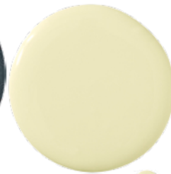
LIME RICKY 393 BENJAMIN MOORE

"I like a light but bright color in a sunny room. This yellow-green is so refreshing and crisp, you almost feel as if you're sipping a lime daiquiri by the pool! And like rum, it mixes well with anything. Pair it with navy blue to go preppy, pink to go bold, or chocolate brown to tone it down."