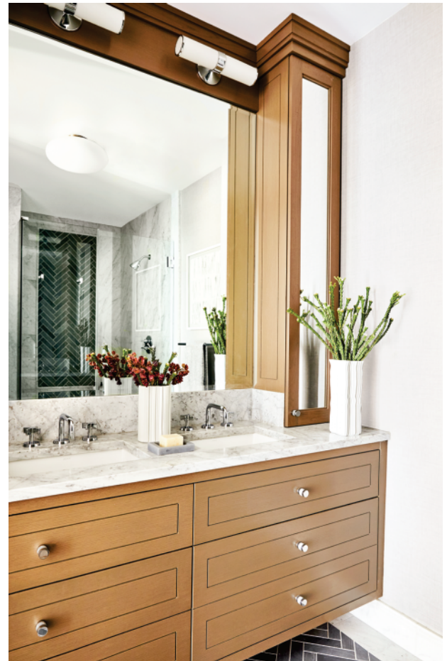
A double sink, six-drawer vanity provides the husband and wife with abundant storage in the master bathroom.