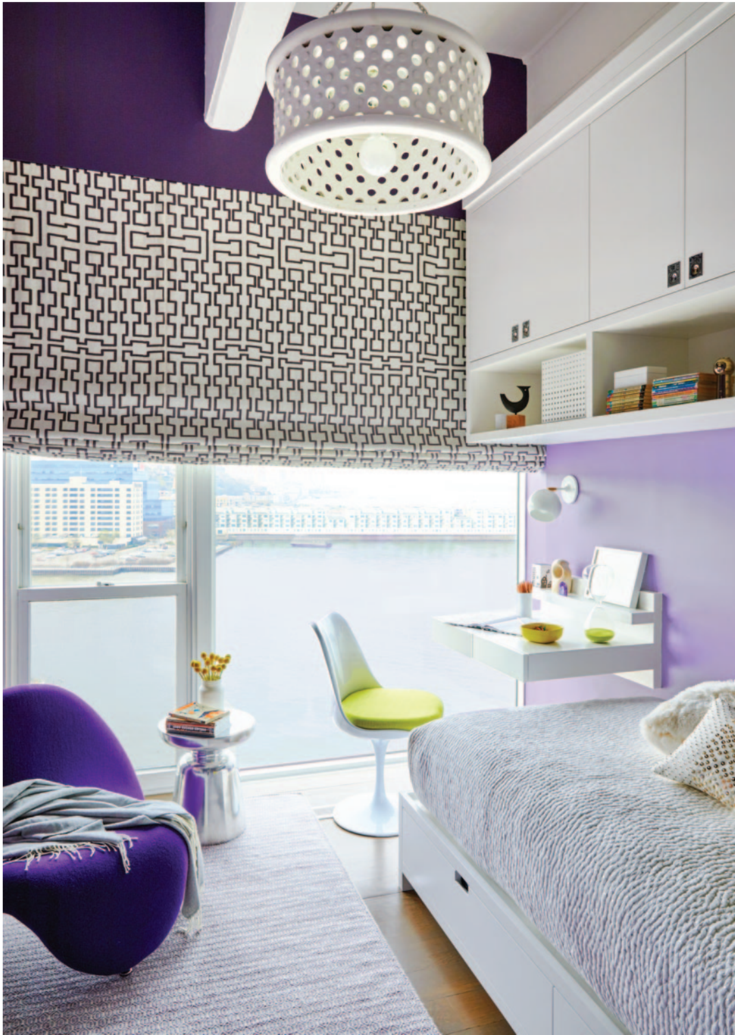
PURPLE BEDROOM | Deep purple walls add drama against the primarily white furnishings in a daughter's room. Contemporary furniture and artwork are sophisticated touches.